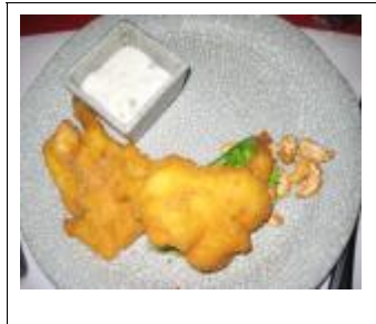
Five Star meal during Tang Dynasty Dinner Show

Today is another highlight of your tour, the Terracotta Warriors Museum . The thousands of life size soldiers and horses were created to guard the tomb of Qin Shi Huangdi, the first Emperor to unite China under his firm rule. The royal tomb itself has yet to be opened but the rank upon rank of Warriors is a sight that is unrivalled anywhere in the world. After lunch, visit the Forest of Stone Tablets museum , which is housed in the Temple of Confucius, has the largest collection of its kind in China with over 3,000 inscribed stone steles. Evening you will attend the deluxe Tang Dynasty Dinner Show at the famous Tang Dynasty Palace where fine food and spectacular entertainment await.