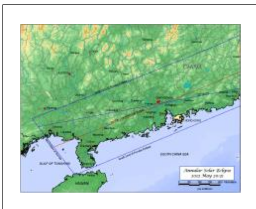
Path of Golden Ring at Sunrise

Tropical Sails Corp will provide safe viewing glasses, also known as Eclipse Shades® to our customers. We will have a limited amount of solar viewing film for cameras and binoculars. If you need larger quantities, see www.rainbowsymphony.com