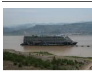
Victoria Cruise Lines China's American owned five star line