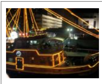
Night cruise on the river.

Morning drive back to Guilin and visit the Reed Flute Cave , named after the reeds used in the manufacture of flutes that grow near it. The cave system has a stunning array of natural limestone formations that are made all the