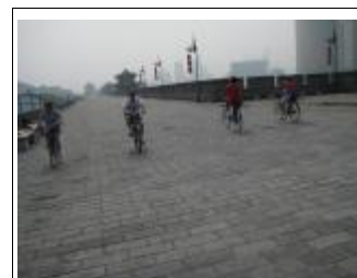
Optional 2 hour 14 km bicycle ride atop the city wall. About $4.

0700-0830 Settle accounts at front desk. 0730 Breakfast/ Luggage out. 0900 Arrive in Chongqing, the destination. Visit Ciqikou ancient town before taking flight to the ancient former capital city of Xi'an, meet local guide on arrival and visit the ancient Xi'an City Wall from the 14th century, one of the most important city walls in China. You will have chance to ride bicycle (OPTIONAL) around this Ancient Xi'an City Wall. Tonight we enjoy a traditional Chinese Dumpling Dinner . Then you will have a chance for a special Chinese foot massage —(OPTIONAL)