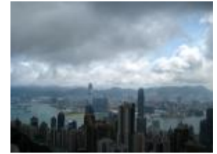
Hong Kong from Victoria Peak