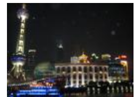
TV Tower of the Oriental Pearl