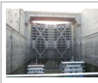
5 Stage Ship Lock

0630 Depart from Yichang/ Enter Xiling Gorge ( 66km ), pass the eastern section of this gorge. 0715 Breakfast. 0800-1030 Shore excursion to the 3 Gorges Dam . 1030 Briefing on Yangtze River. 1100 Pass the 5-stage ship locks of the 3 Gorges Dam ( 3.5 hrs ). 1200 Lunch. 1445 Pass the western section of the Xiling gorge. 1800 Dock at Badong. 1830 Captain's welcome cocktail party. 1900 Dinner. 2030 Fashion show .