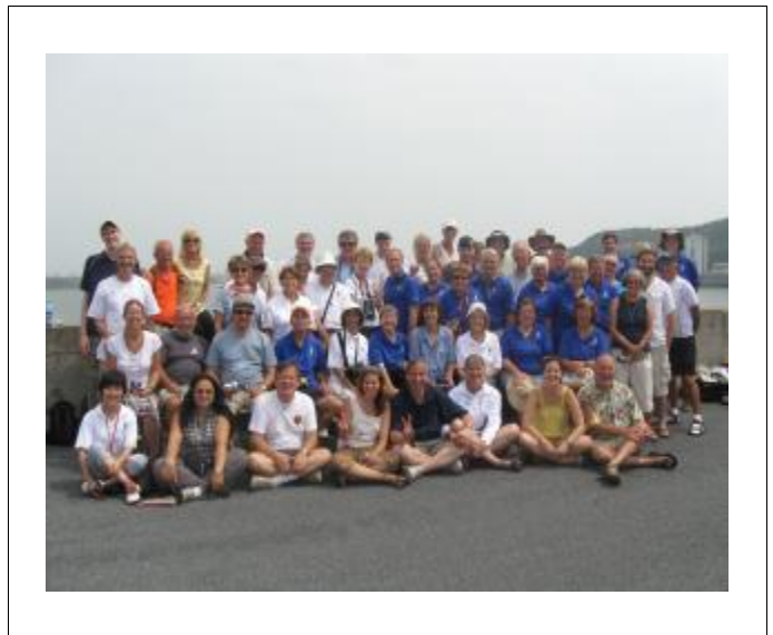
Happy Eclipse Chasers, Tianhuangpig reservoir near Anji, Zhejiang

Past customers suffered with the weather. A July and August solar eclipse led us deep into China at the wrong time