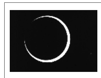
Annular Eclipse in progress

In the early morning watch the Annular Solar Eclipse at sunrise from 5 am to 8 am. Then take train to Hong Kong, transfer to hotel. Free at leisure. Overnight in Hong Kong